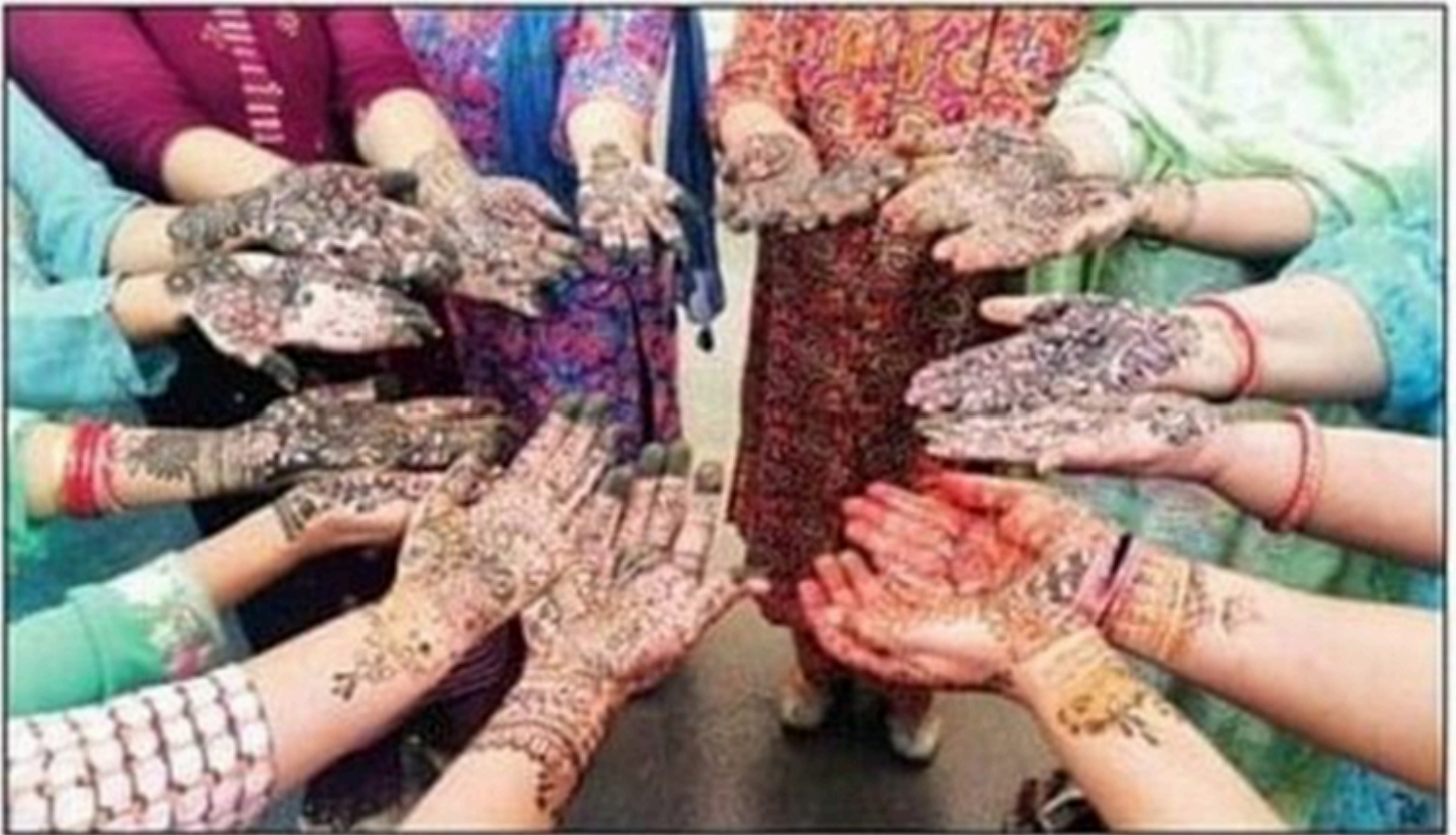
जीएलडीएम डिग्री कॉलेज में प्रतियोगिता के दौरान हाथों पर सजी मेहंदी।